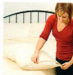
Solus Organic Cotton Dust Mite Mattress and Pillow Encasements