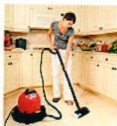
Ladybug XL2300 Vapor Steam Cleaners with TANCS