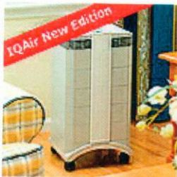
IQAir HealthPro Series Air Purifiers