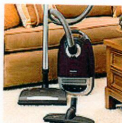
Miele S5981 Capricorn Canister Vacuum Cleaners