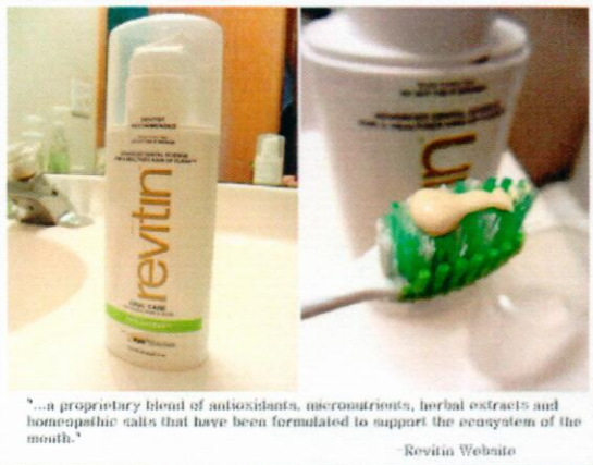
*...a proprietary blend of antioxidants, micronutrients, herbal extracts and homeopathic salts that have been formulated to support the ecosystem of the mouth.* -Revitin Website